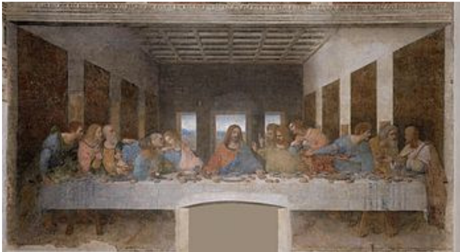
The Last Supper by Da Vinci