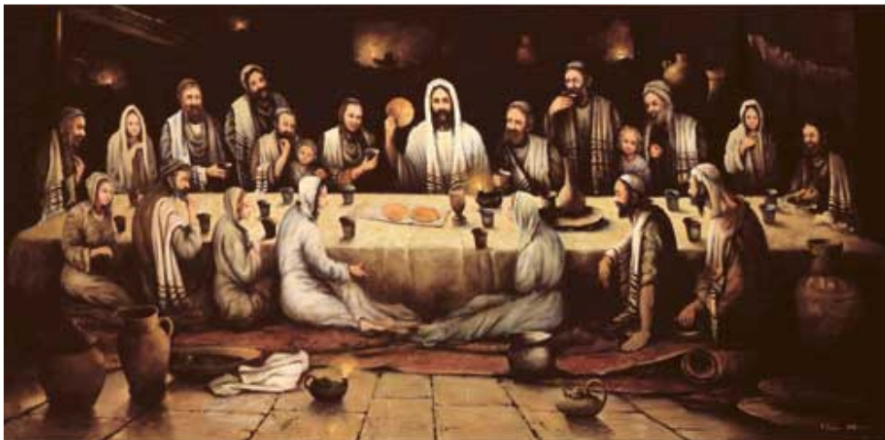
The Last Supper by Piaseki